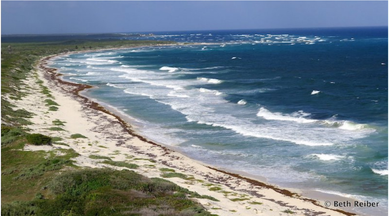
Punta Sur Eco Beach Park

If you don't dive or snorkel—or even if you do—there's the Atlantis . Diving more than 100 feet below the surface, the submarine offered us the rare chance to experience an underwater world usually visible only to divers, including coral reefs, a 2,000-foot drop-off wall and a 1943 minesweeper, sunk on purpose in 2000.