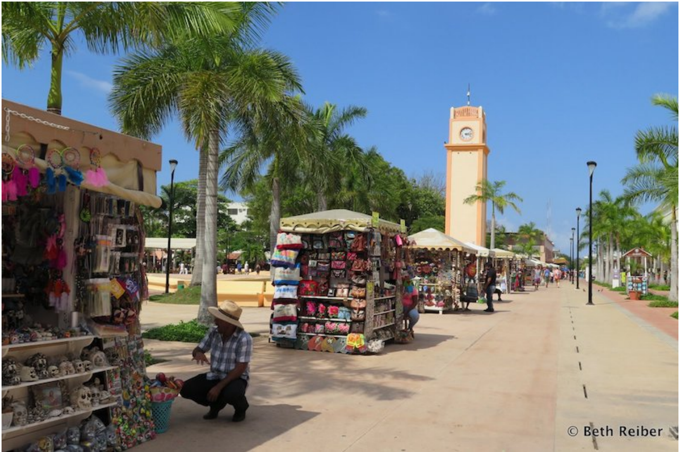
San Miguel's main square