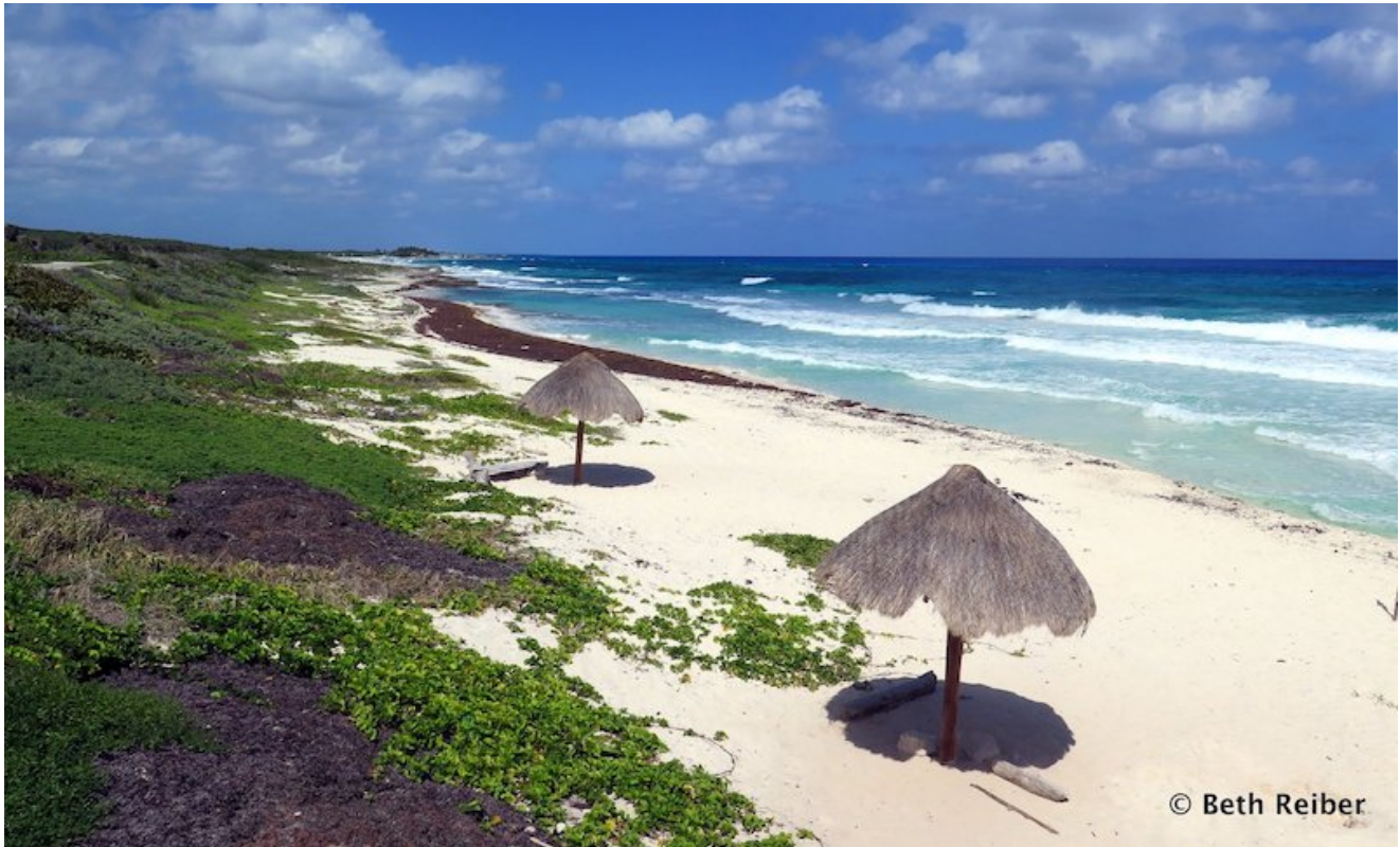
The east coast of Cozumel

At the southern tip of the island is Punta Sur Eco Beach Park, a protected peninsula with probably Cozumel's prettiest beach, a restaurant, snack bar, rental snorkeling equipment, and boat rides in a lagoon where you might see crocodiles.