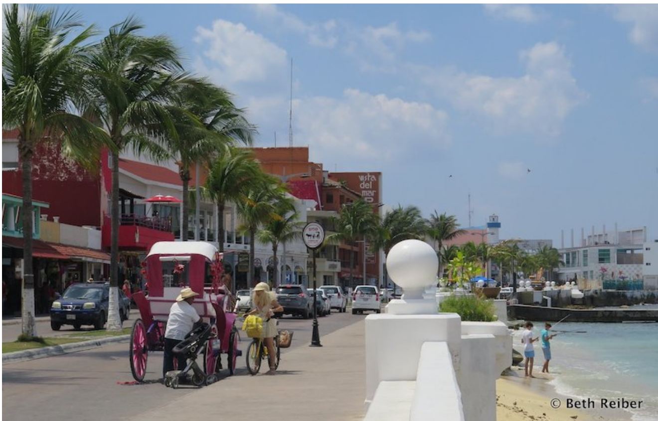
San Miguel's colorful waterfront

San Miguel, the island's largest town, is home to most of the island's 80,000 residents, an international airport, docks for cruise ships (we counted as many as five ships at dock each day), and ferries that travel between Cozumel and Playa del Carmen on the Yucatan coast in 35 minutes. Its lively waterfront buzzes with cruise passengers, day-trippers from the mainland, and vacationers staying in hotels and resorts that spread north and south of San Miguel on the island's west side — or, like us, in rental homes and apartments in town.