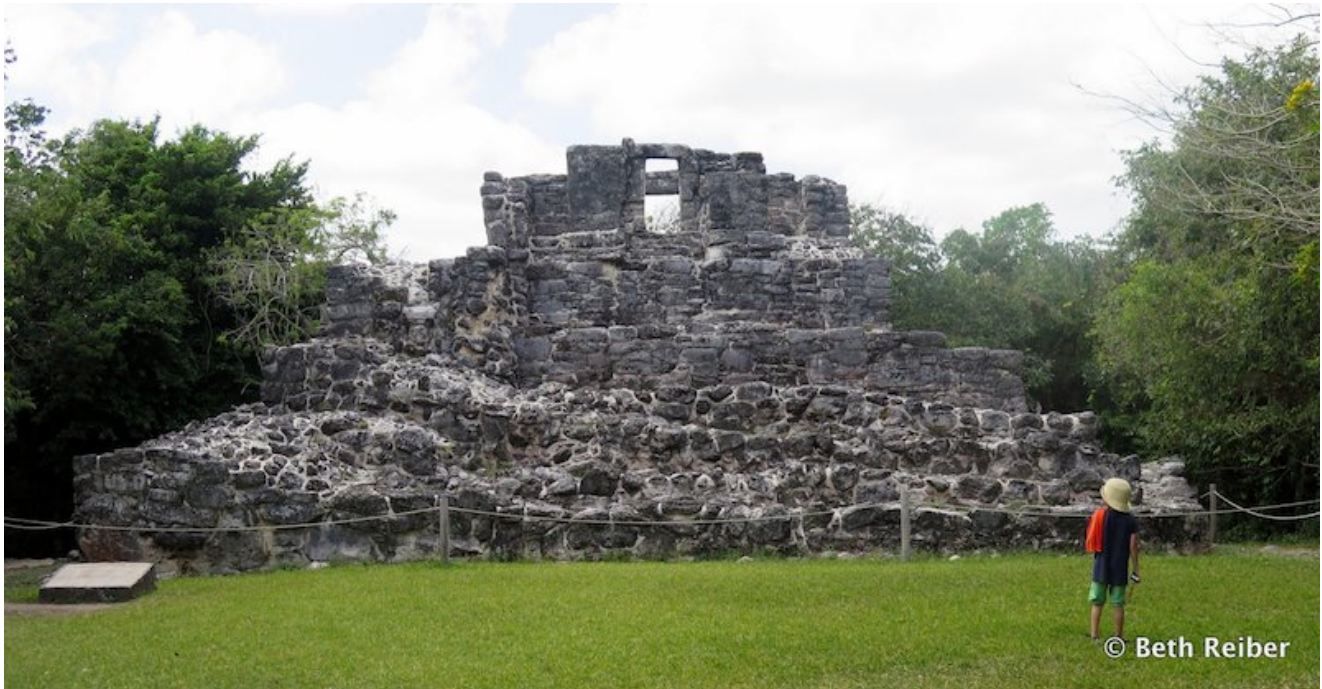
Approaching the Ixchel Temple

Because my friends had had enough walking around by then, I continued on my own to Ka'na Nah, a temple devoted to Ixchel that stands in a small clearing. The pyramidal ruin leaves much to the imagination, but as I stood there, everything around me came vividly into focus. My senses were acutely aware of the deep blue sky punctuated by white clouds, the wind rustling through trees, birds chirping, butterflies lirting in the air, a hawk soaring majestically overhead. And my one thought was: Ixchel. Maybe I was feeling the power of Ixchel.