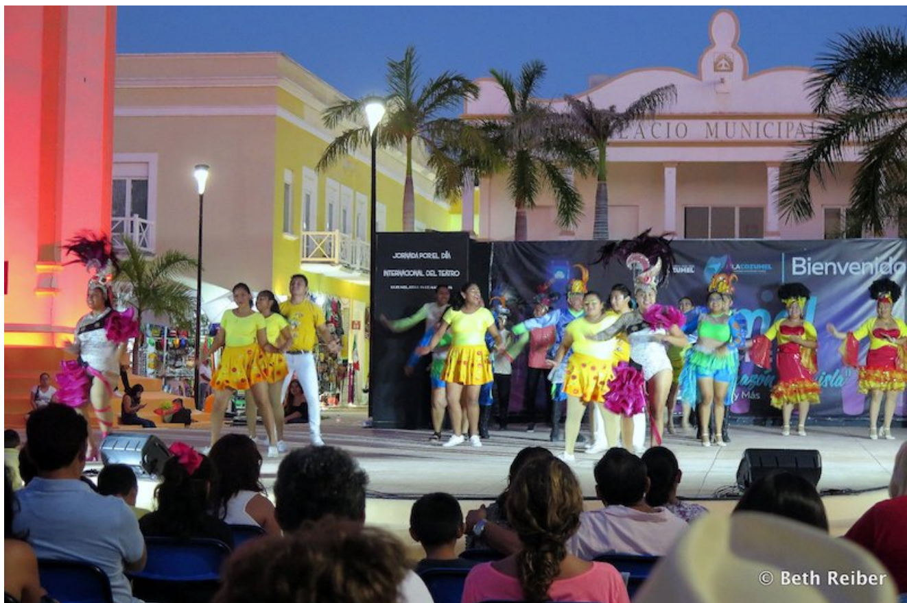
Sunday evening at San Miguel's main square

Sundays, when no cruise ships come to port, locals head to the beaches during the day and gather on the main plaza at night for stage performances of dance and theater. Tables set up by various fundraising groups sell pizza, pasta and desserts to families pushing strollers, people walking dogs, children roller skating, and teenagers hunched over cell phones.