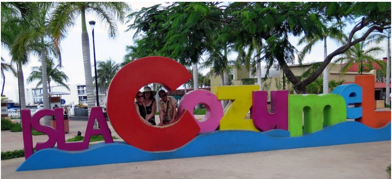
The author and two friends, making memories in Cozumel

Of course, it wasn't entirely my fault. I was with two women I've known since we were in college, more than four decades ago, when we all spent a year abroad in Germany. And because we don't live in the same town or even on the same continent (and can't remember how long it's been since our last reunion), Cozumel was our chance to catch up, sit around