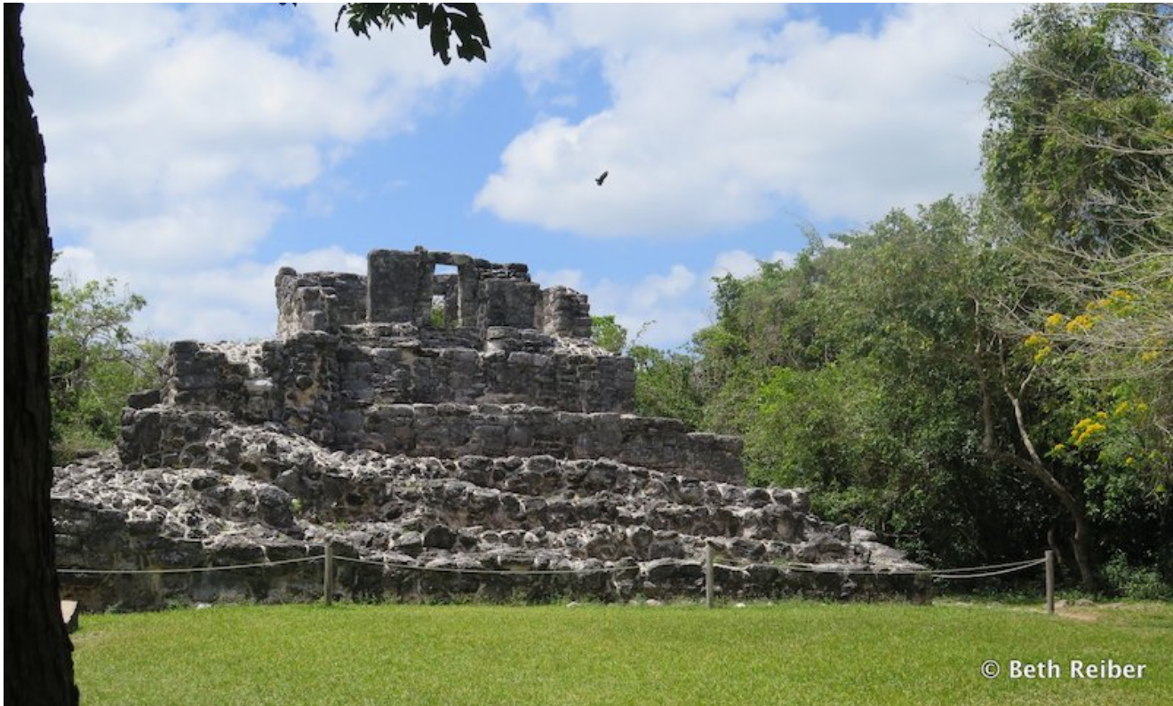
Ixchel Temple at San Gervasio