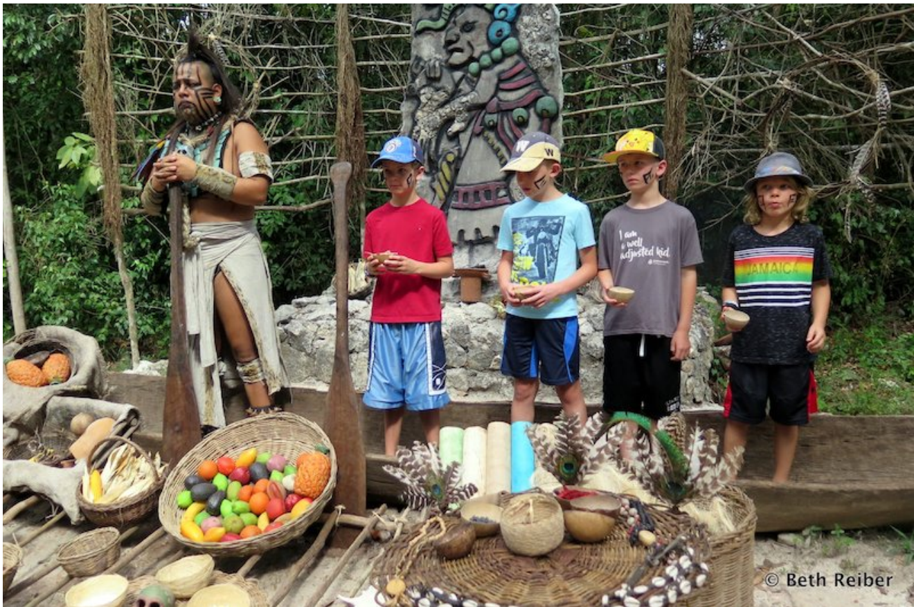
A group of young visitors make offerings to Ixchel at Pueblo del Maiz

This is an especially great outing to share with grandkids, or, like us, with friends who are kids at heart.