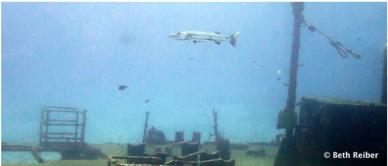
View of sunken ship from the Atlantis