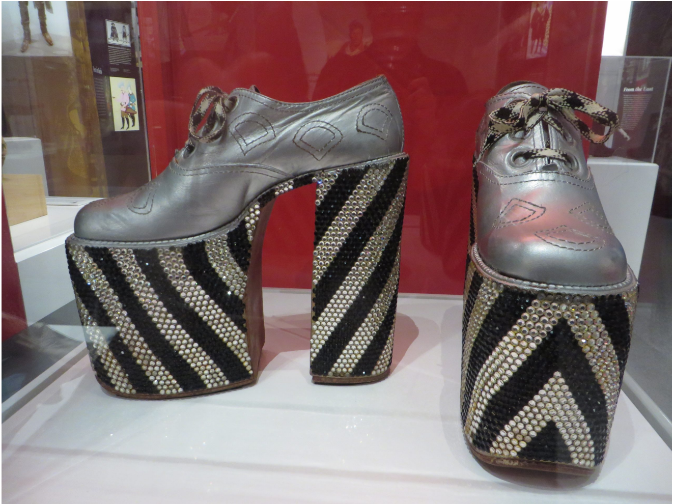
Elton John's High Heels at the Bata Shoe Museum

It may not be the soul of Toronto, but it's the world's largest number of soles in one place. The Bata Shoe Museum contains almost 26,000 of them in its collection of 13,000 pairs of footwear dating back more than 4500 years.