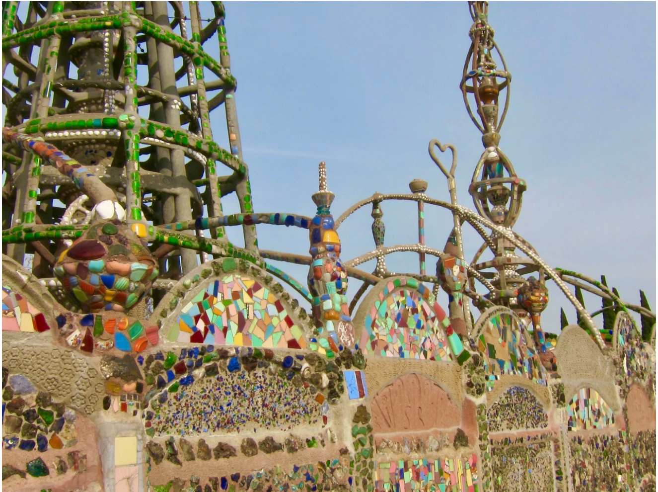
Watts Towers

Once upon a time—in 1921 to be exact—Simon Rodia, an Italian immigrant construction worker and tile mason, took some glass and pottery fragments and cast-off steel pieces and began building a tower in the backyard of his Watts home. Over 33 years, he constructed a wonderland of 17 majestic towers interwoven with colorful mosaics and unusual sculptural features.