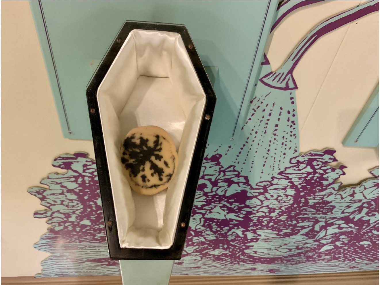
Canadian Potato Museum

The hand-sized coffins cleverly show potatoes gripped with some of the 260 viruses, bacteria and fungi that inflect them — like blackheart, white grub and ring rot. Don't let this gruesome exhibit turn you off a stop at the museum's PEI Potato Country Kitchen for a feed of fries, poutine, potato soup, potato skins, loaded baked potatoes and lobster rolls with potato salad. PEI potato farmers grow about 100 kinds of spuds. Check out the agricultural equipment area and ask about the farm tours.