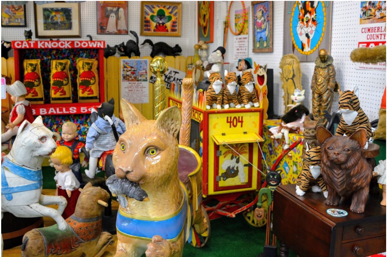
A few of the thousands of objects of the extensive collection at The American Museum of the House Cat.