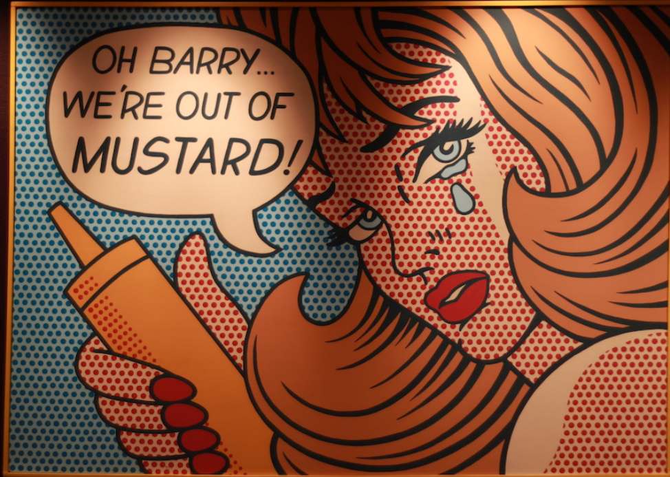
A Roy Lichtenstein mustard parody

Home to the world's largest collection of mustards, the National Mustard Museum is more than a museum. It's a lively place where visitors (entrance is free) can learn about mustard, sample exotic mustards like cranberry chardonnay, and buy one of the 6,000 jars from some 80 countries. And they can also learn fascinating facts like the largest producer of mustard seed are the Canadian provinces of Alberta and Saskatchewan.