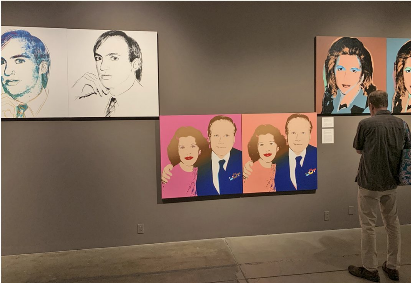
Andy Warhol museum

Who knew there was so much to learn about Andy Warhol? Located in the city where he was born, The Andy Warhol Museum holds the most extensive collection of Warhol's works. These include iconic paintings, drawings, commercial illustrations, sculptures, prints, photographs, wallpapers, sketchbooks, and books. The whole makes it one of the world's most comprehensive single-artist museums. (Yep, Marie Kondo would disapprove of Andy Warhol-the-packrat.)