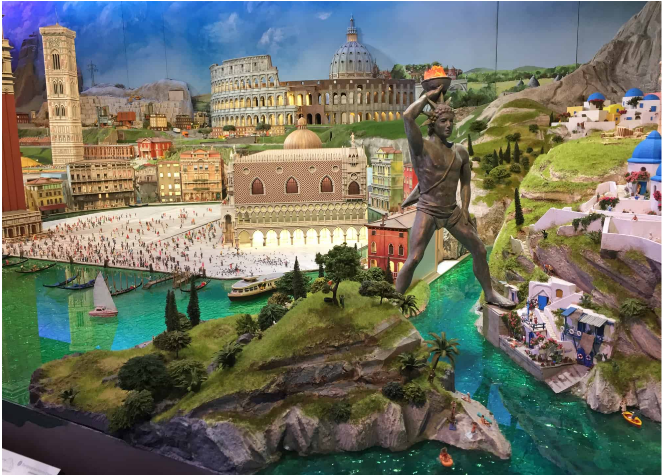
Gulliver's Gate

Visit the mind-boggling Gulliver's Gate exhibit if you find yourself in New York's Times Square with some time to kill before a Broadway show. I spent about 90 minutes ooing and ahhing over this unique, miniature-worlds museum and plan to return when I have more time.