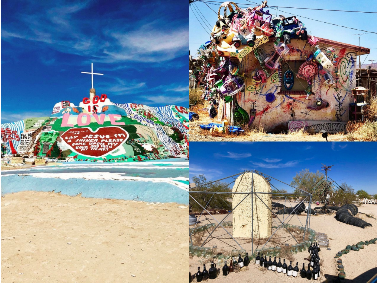
Offbeat sites around California's Salton Sea

Talk about quirky! Several communities edging Southern California's Salton Sea house some of the most unusual, unique, and curious collection of outdoor exhibits in the history of art. Although not officially designated museums, these communities exhibit a variety of artistic endeavors that go way beyond the word quirky.