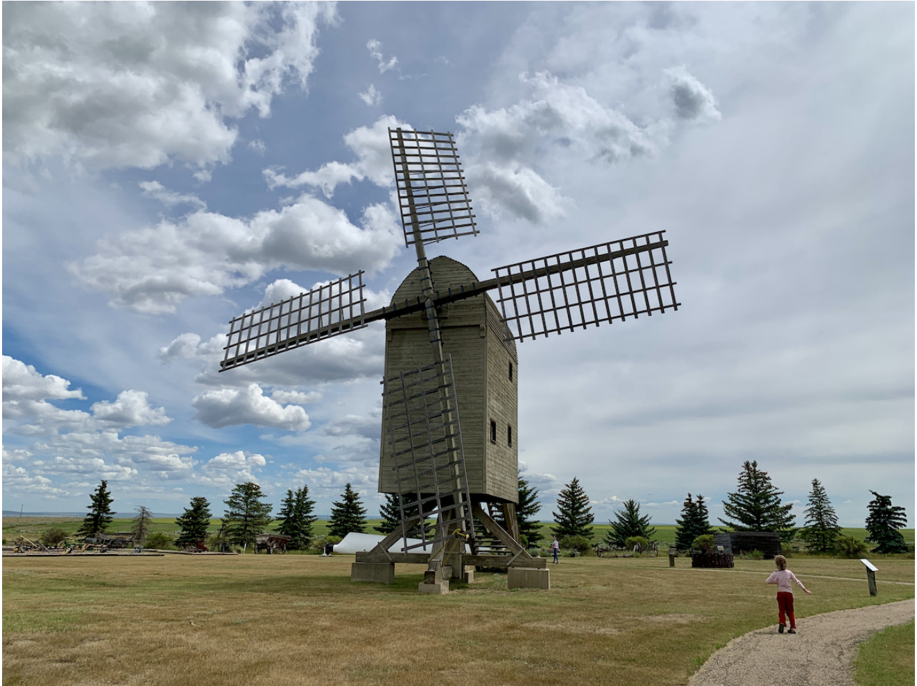
Windmill Museum

Etzikom may only have 54-odd people, but it's home to a two-for-one museum experience: the Canadian Historic Windmill Interpretive Centre and the Etzikom Museum . An outdoor collection of antique windmills dates back to 1995 and revolves around the fact that “it wasn’t the gun that settled the west — it was the windmill.”