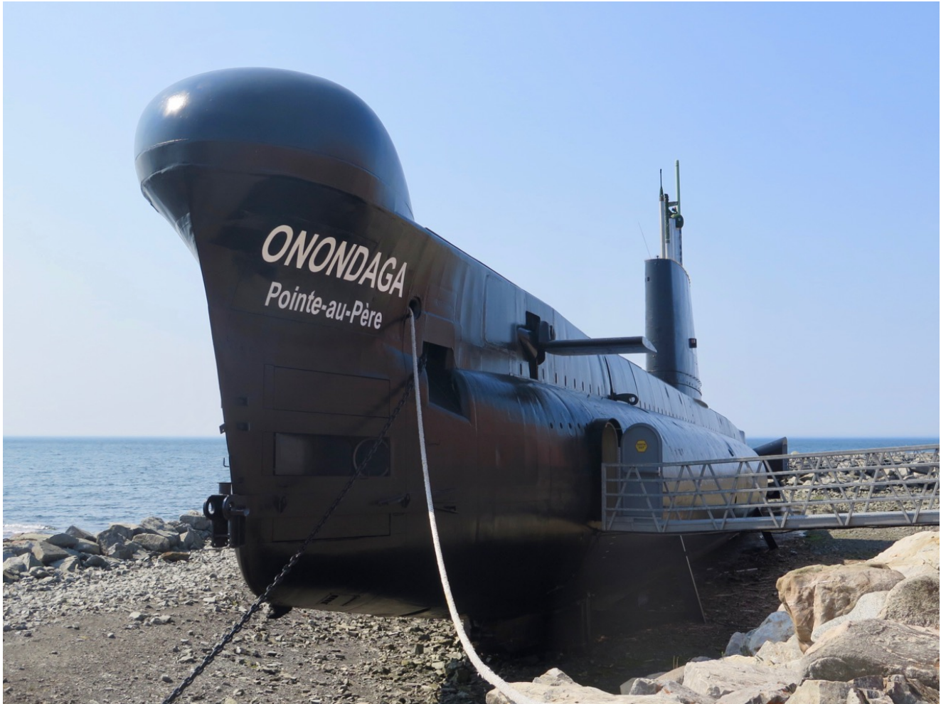
Canadian sub Onondaga, Point-au-Père Maritime Museum

Discover what it's really like to be in a submarine at the Point-au-Père Maritime Museum. Retired by the Canadian Navy in 2000, the Cold War-era Canadian sub Onondaga now rests on the St. Lawrence River shoreline on the city's eastern side. Visitors make their way through the entire sub on a self-guided, nose-to-tail audio tour. It covers everything from the engines and crew quarters to the galley and torpedo room. It's tight and cramped, so not a good choice for those with claustrophobia.