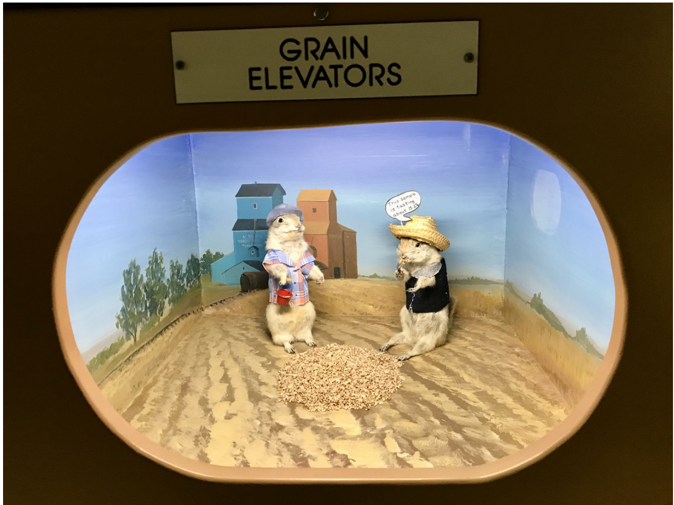
Gopher Hole Museum

Taxidermy aficionados will make the 75-minute drive from Calgary to Torrington just to say they've been to the World Famous Gopher Hole Museum . In a single, darkened room of this quirky Canadian Museum, you will find 77-odd taxidermied gophers mounted in 47 lit dioramas. You'll see gophers celebrating small-time life and doing things like playing hockey, camping, hunting, attending church, stealing a moonlight kiss, waiting for a train, shopping at a general store and welcoming tourists.