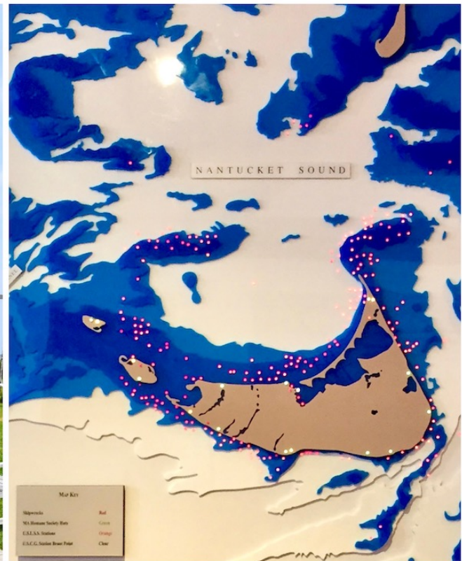
Left: Nantucket's Shipwreck and Lifesaving Museum. Right: Interactive map of shipwrecks off the coastline of Nantucket.

While the beaches are certainly the main event on the beautiful island of Nantucket, visitors will find an abundance of history around every corner. When you need a change of pace from sun and surf, head to the Nantucket Shipwreck and Lifesaving Museum . This affiliate of the Egan Maritime Institute is housed in a renovated lifesaving station. More than 5,000 whimsical, unusual and historical items relating to the theme of the sea fill the interior. Visitors will experience a glimpse of life when the island was the Whaling Capital of the World.