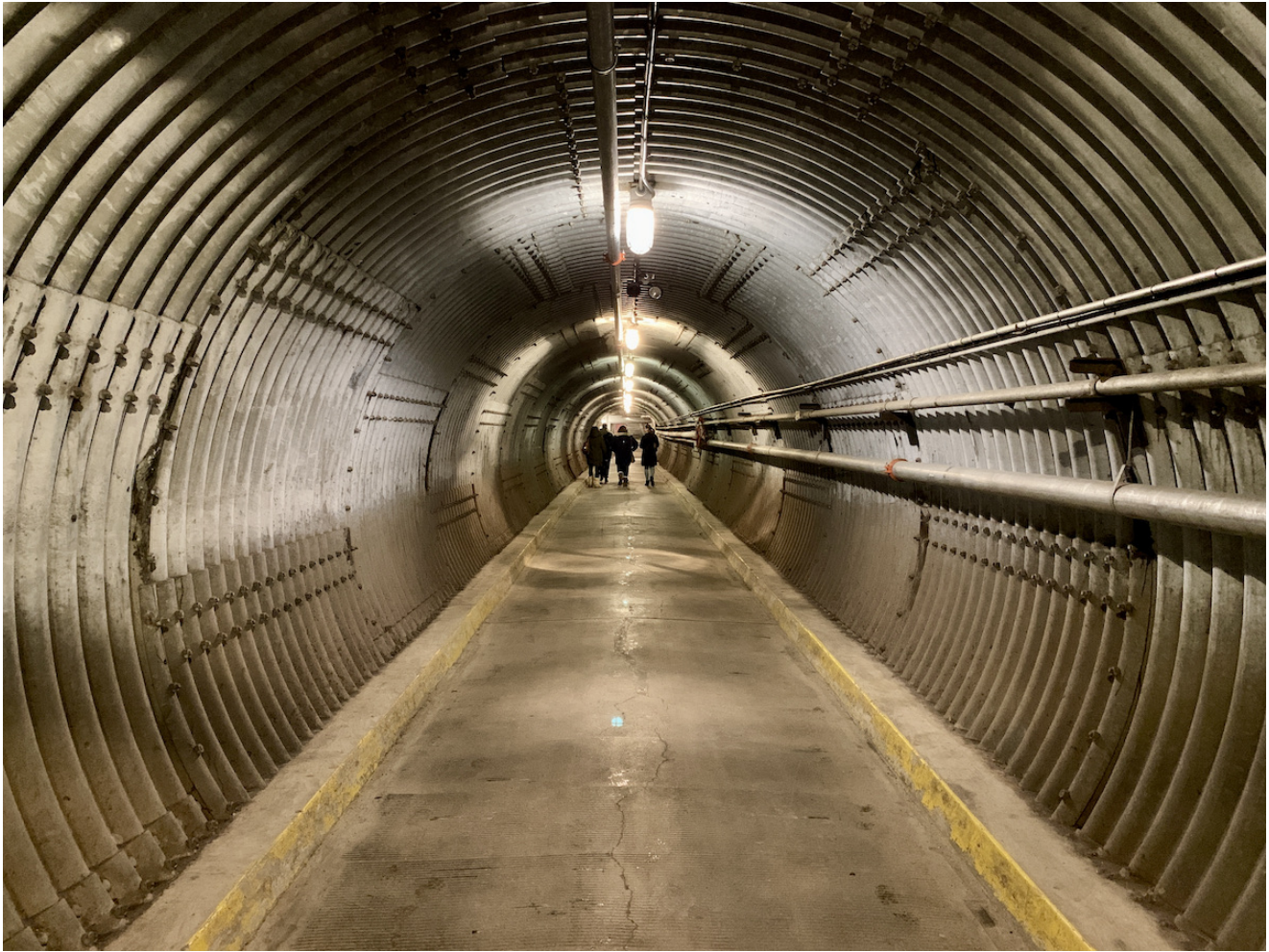
Diefenbunker blast tunnel

Thirty minutes west of Ottawa's Parliament Hill in the rural village of Carp is a massive, four-storey, underground bunker from the Cold War era. The Diefenbunker was secretly built from 1959 to 1961 on the orders of Canadian Prime Minister John Diefenbaker to hold 535 government and military officials for 30 days in the event of a nuclear attack. It was made from hand-poured concrete and steel to withstand a five-megaton nuclear blast from just over a mile away.