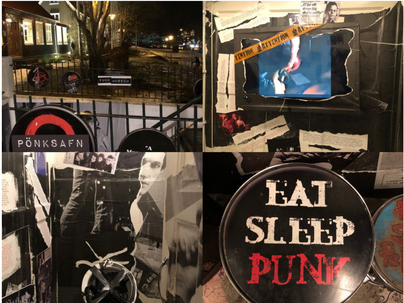
Icelandic Punk Rock Museum

Located in a former underground public toilet, the Icelandic Punk Rock Museum is quite the adventure. This may not be your scene or at the top of your wish list, but we found its colorful historic displays clever and funky for anyone who wants to learn more about music.