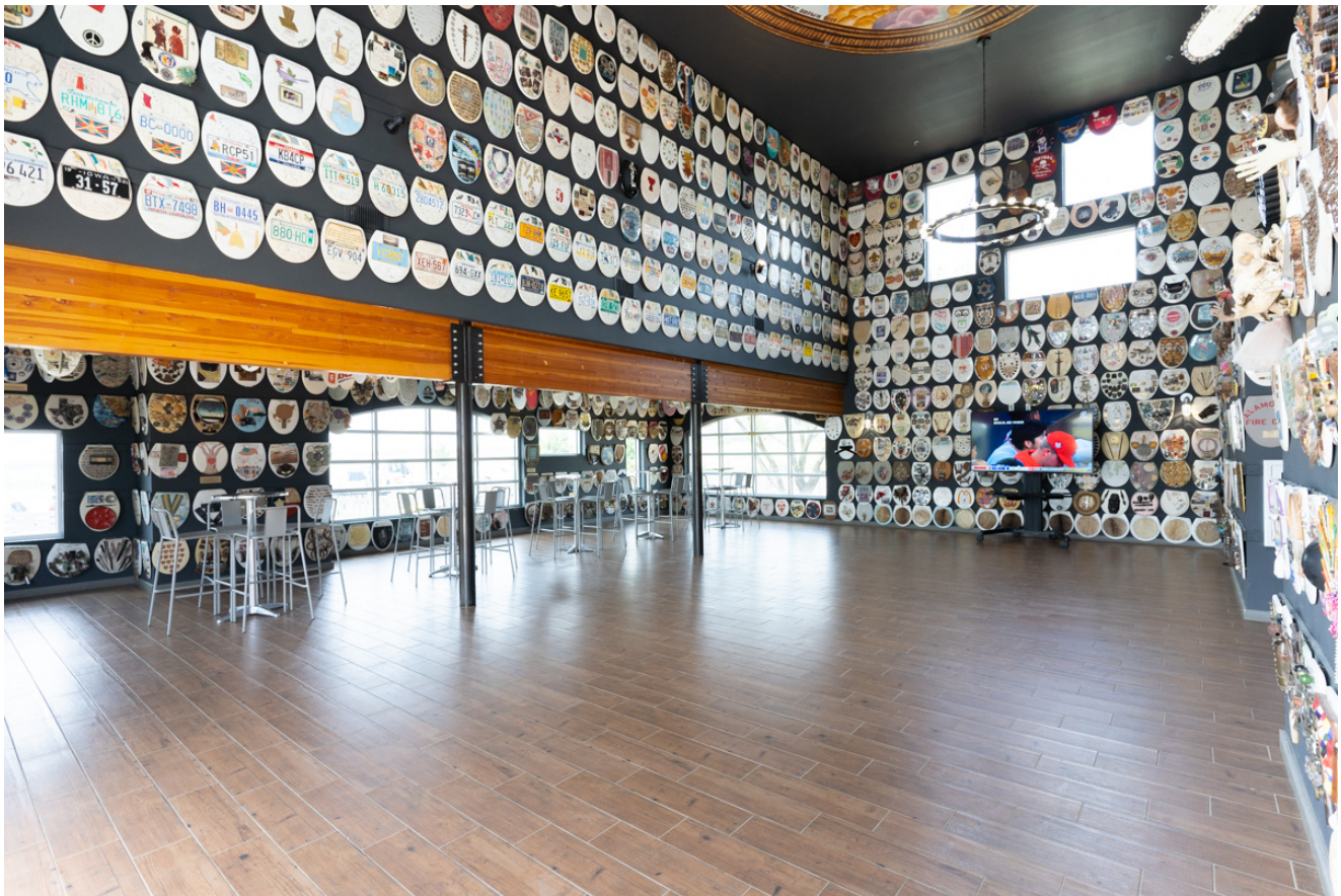
Barney Smith's Toilet Seat Museum