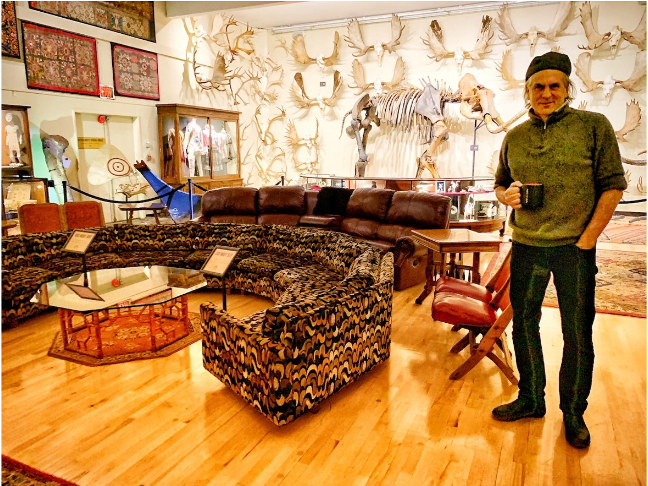
Canada's quirky Hand of Man Museum

Television star Jim Shockey is a big deal in global hunter/naturalist circles. But the Canadian who has been collecting since he was 10 years old, and who has travelled extensively for more than five decades, opened the Hand of Man Museum in 2018 to share his private collections with his fans. The one-of-a-kind museum of “natural history, cultural arts and conservation” is in Maple Bay on Vancouver Island, about an hour north of Victoria. It's also open 365 days of the year.