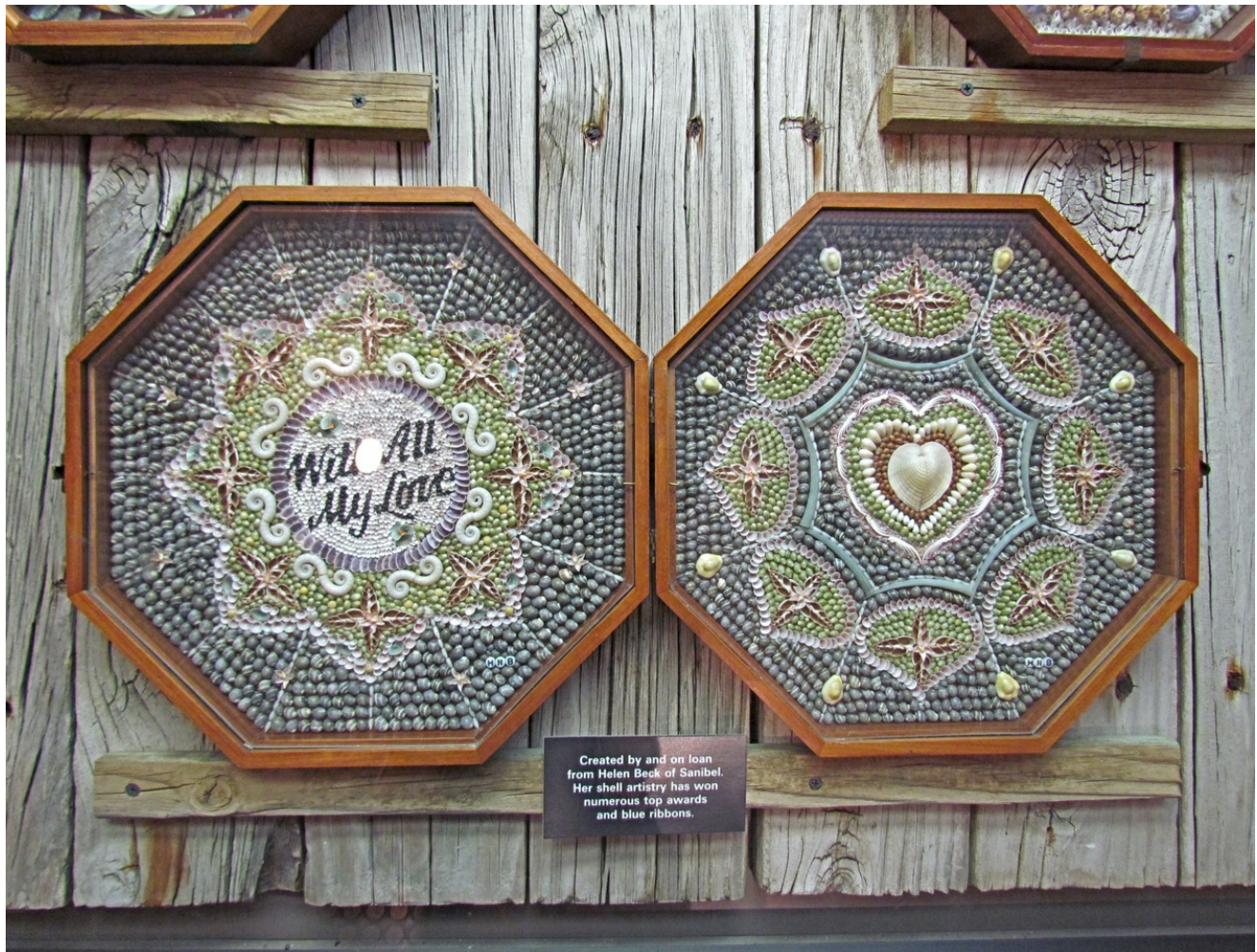
Delicate shell art in the style of a sailor's valentine created by a local artist