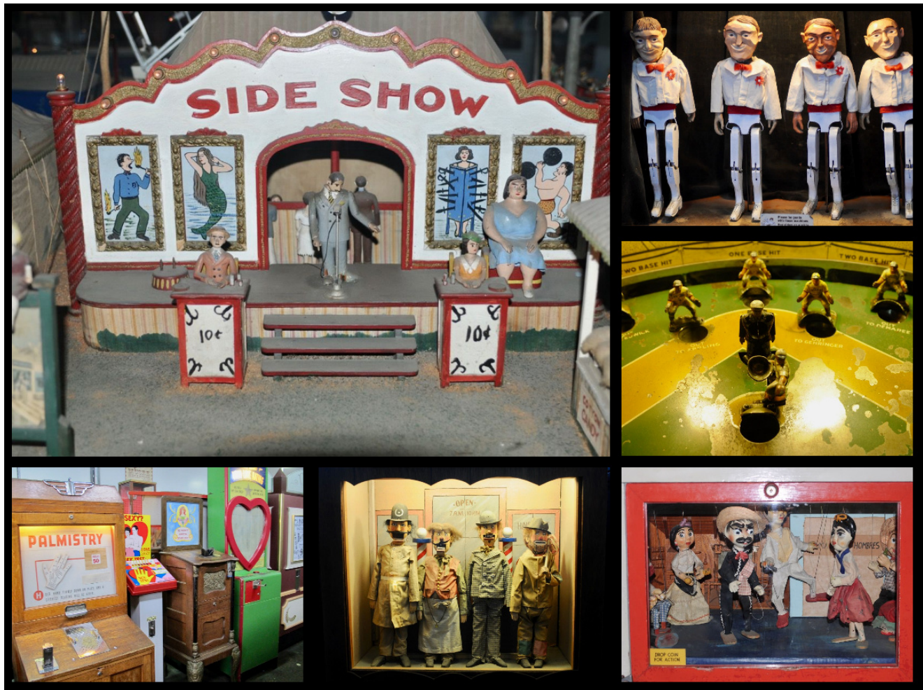
Musée Mécanique