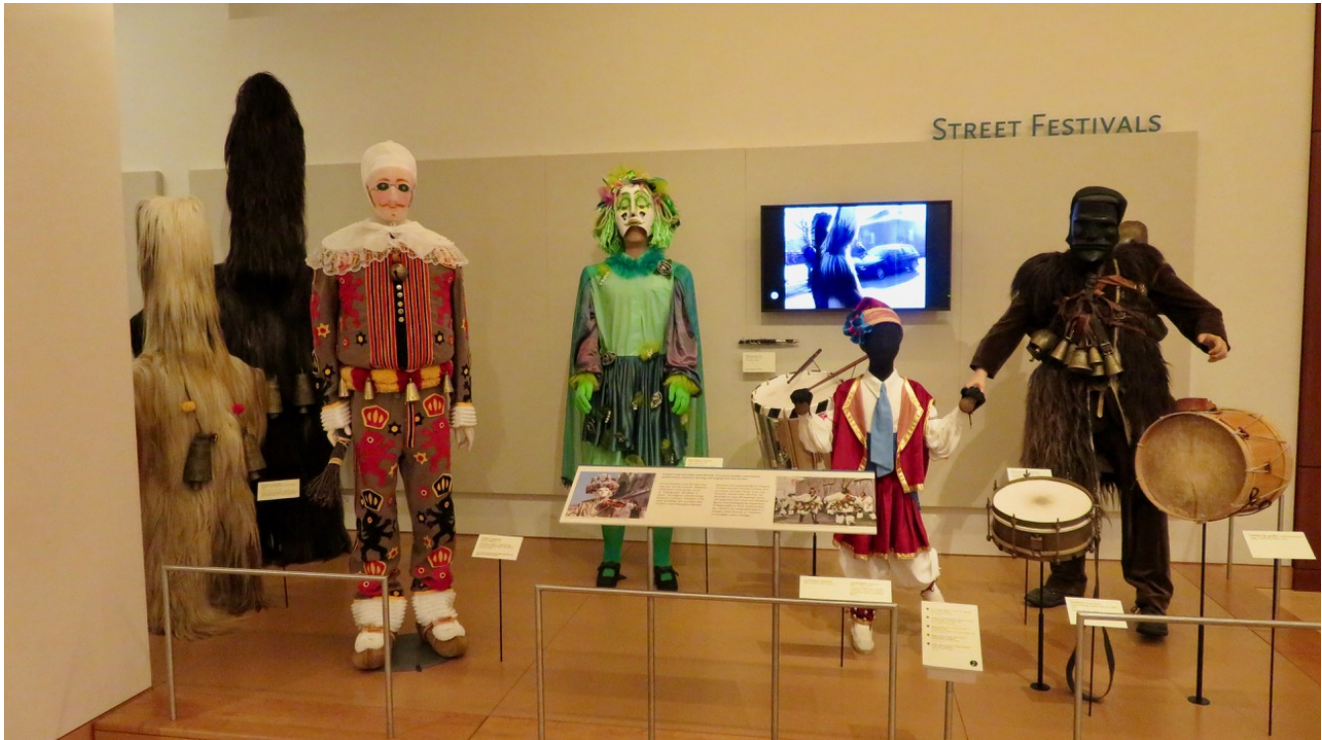
A display at the Musical Instrument Museum in Phoenix

The Musical Instrument Museum (MIM) of Phoenix, Arizona, gets top billing as a must-see city attraction. And it receives a nod as being one of the top 15 museums in the United States. But don't think of boring museum exhibits when you think of the MIM. This contemporary urban facility hosts up to 300 live concerts each year featuring a wide variety of global music. It also exhibits approximately 8,000 musical instruments from around the world.