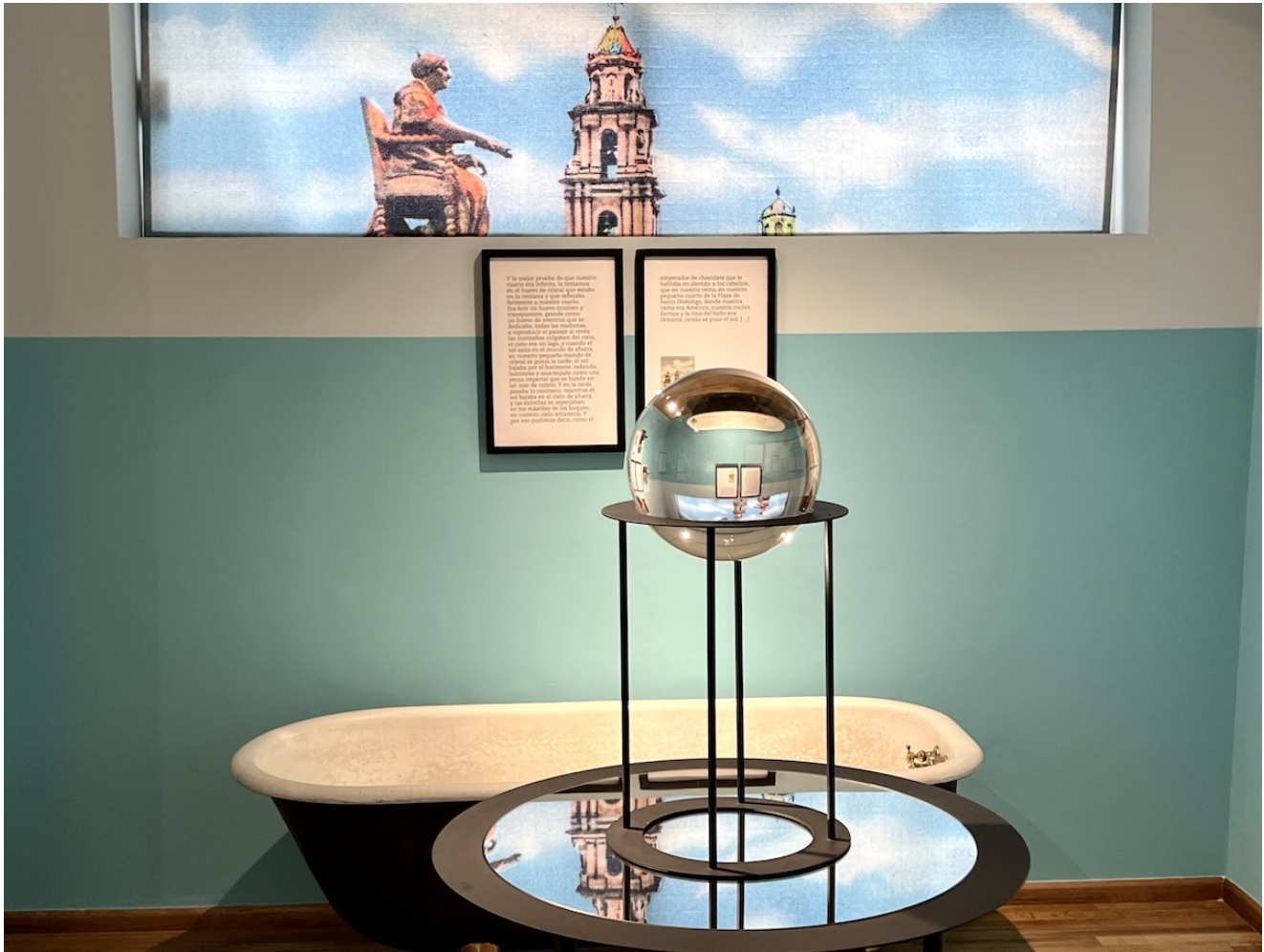
MODO Museo del Objeto del Objeto

One of the most unusual of Mexico City's many museums is the Museo del Objeto del Objeto (MODO) . Located in a restored mansion in the heart of the bohemian Roma Norte neighbourhood, its name translates to “The Purpose of the Object Museum.” That captures its mandate to present the history and design of everyday objects found in Mexican daily life.