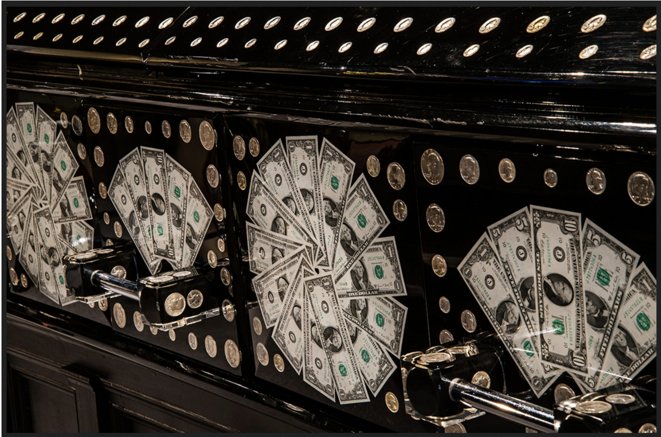
Money casket

It sounds creepy, but the exhibits at the National Museum of Funeral History provide a fascinating combination of history, science, art, and death. The museum's motto offers words to live by: "Any Day Above Ground is a Good One."