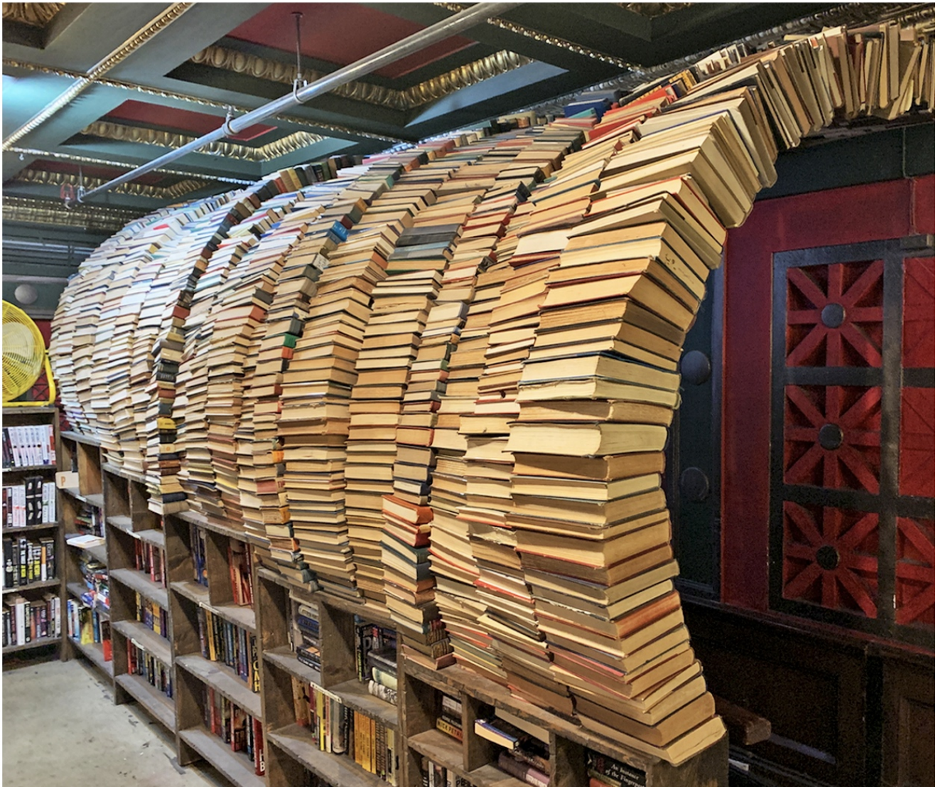
The Last Bookstore

Bibliophile travelers shouldn't miss the Last Bookstore, a funky Los Angeles temple to books. Housed in the former grand atrium of a 100-year-old downtown bank, it comes complete with a vault filled with books and rumored ghosts. Yes, this is a working indie bookshop selling new, used, and collectible books (as well as vinyl records and graphic novels). But this cavernous bi-level space is also a museum of books, with photo-worthy book sculptures and nooks of whimsical installation art extolling writing and literature around every corner.