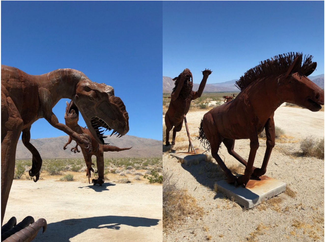
Galena Meadows