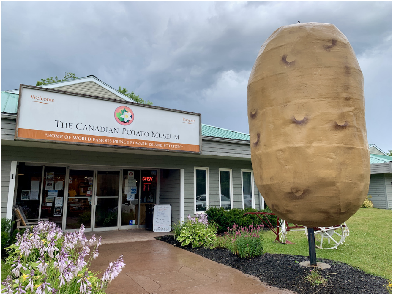
Canadian Potato Museum outside

One Big Potato, 14 tiny potato coffins and a potato-themed café. There's plenty to love at the Canadian Potato Museum . The Big Potato is one of those "roadside attractions" people love to photograph themselves with, only this faceless, genderless spud of the Russet Burbank variety stands outside the front door of the seasonal museum.